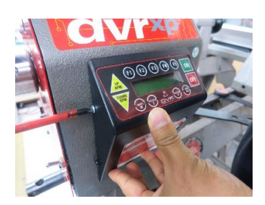
Re fix New Control Panel and switch on power and test New Control Board.