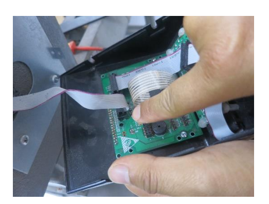
Plug in Motor Controller Cable to New Interface Panel. Make sure it is firmly pushed home in socket.