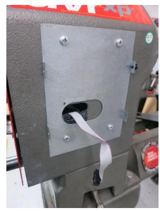
Control Board (Interface Panel) disconnected from Motor Controller Cable