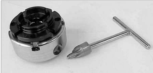
Geared chuck key with moveable head

There are a number of different keys/bars that will operate your chuck. The different keys are shown below: