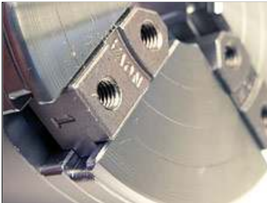
PM Cast plus shaped Jawslide