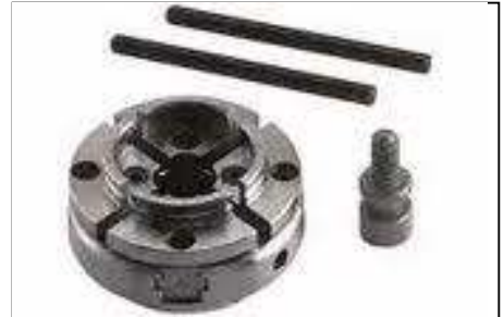
2 Operating bars

Original Nova Precision Midi Nova Compac