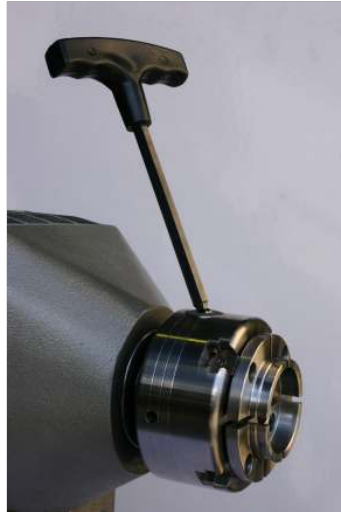
8mm T bar Hex key