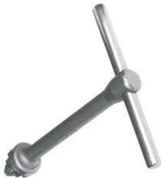
Solid Geared Key

Original Nova Precision Midi Nova Compac