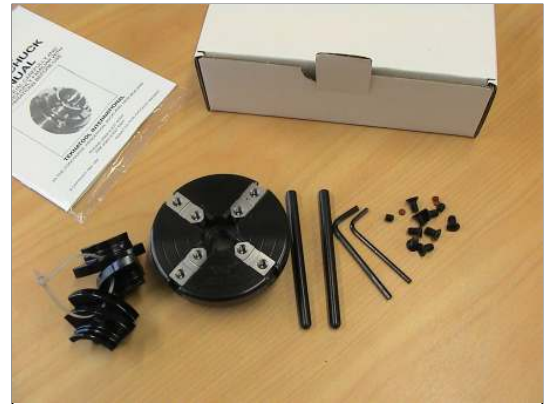
Machined square jawslide

Original Nova Chuck Supernova Chuck Supernova Deluxe